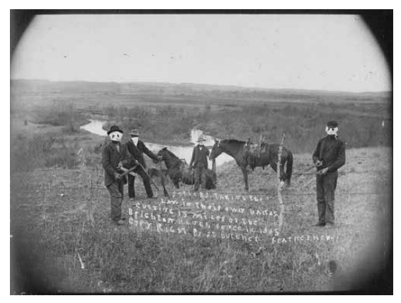
"Settlers taking the law into their own hands.", Nebraska, c. 1885.